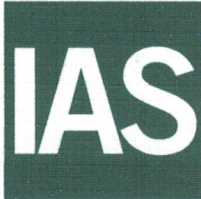
King Cert International Certification Ltd. Director

ACCREDITED Management Systems Certification Body MSCB-196